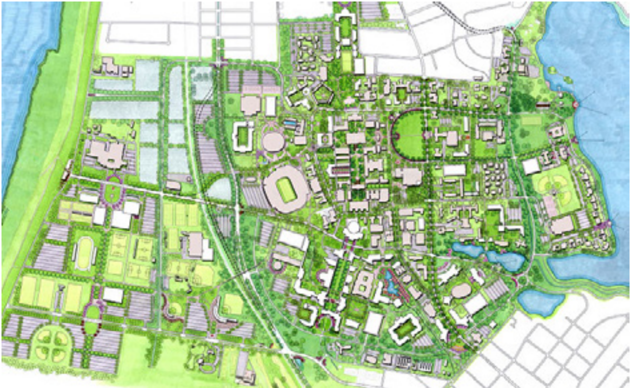
Map of LSU provided by the Cook Hotel online 26